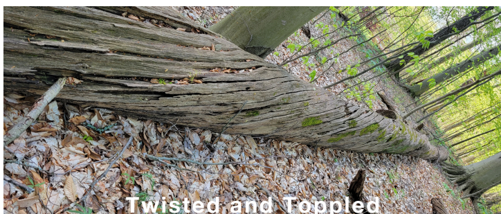
Twisted and Toppled