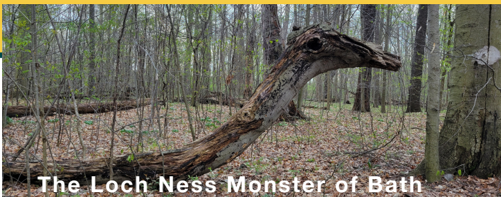
The Loch Ness Monster of Bath

CAN YOU FIND IT ON THE TRAIL? Bath Township Parks are full of discoveries! Can you find these unique features throughout your parks?