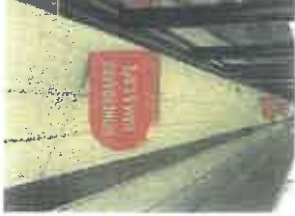
EXISTING FACES TO BE REMOVED & REPLACED