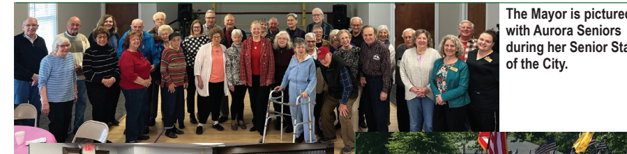
The Mayor is pictured with Aurora Seniors during her Senior State of the City.