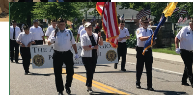
The Mayor, a member of the Legion Auxiliary, filled in Memorial Day carrying the colors with the VFW and American Legion veterans.