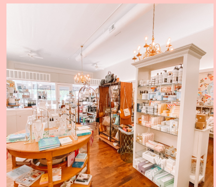
Greek's Bearing Gifts