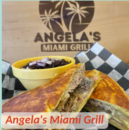
Angela's Miami Grill