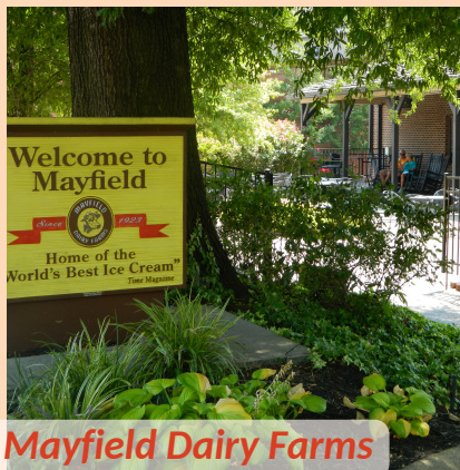
Mayfield Dairy Farms