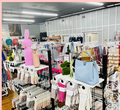
The Sock Shop