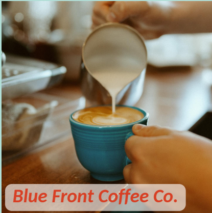
Blue Front Coffee Co.