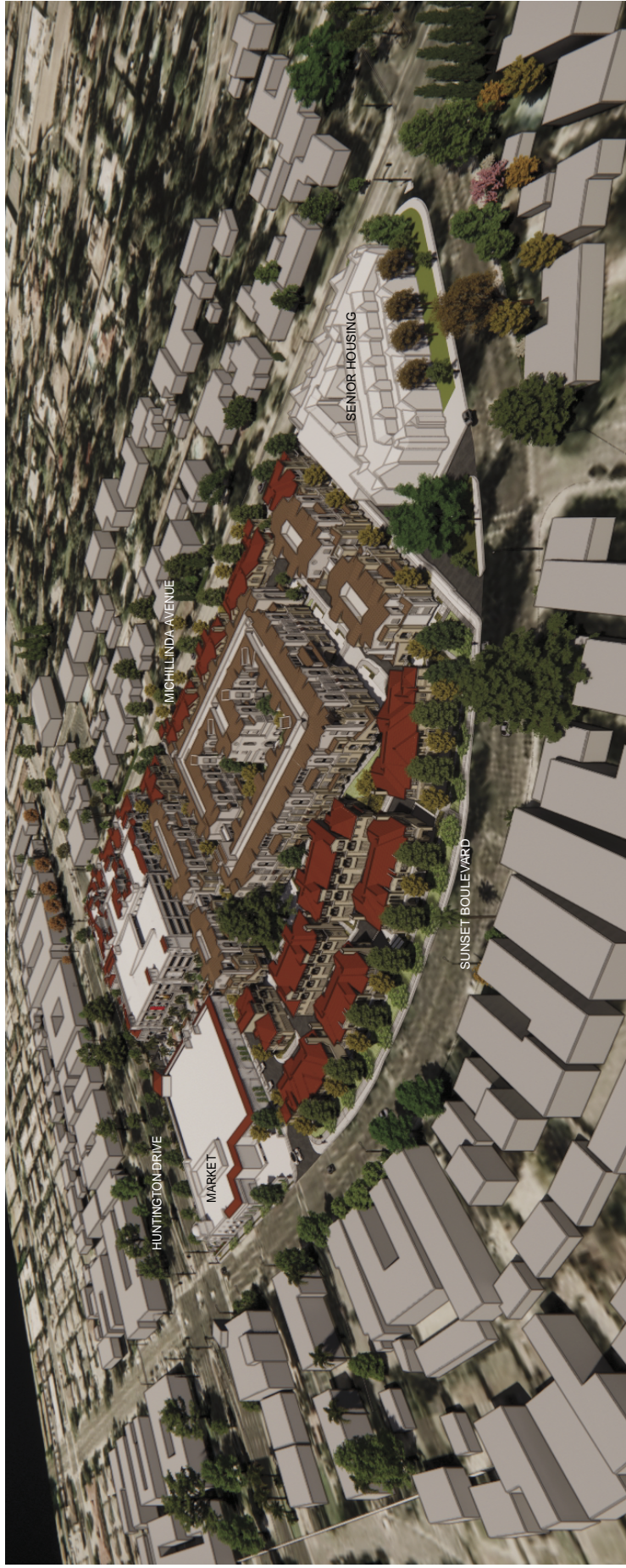
1. BIRD'S EYE VIEW FROM SUNSET BOULEVARD