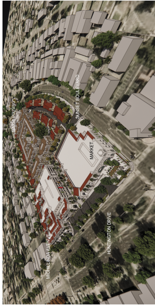
2. BIRD'S EYE VIEW FROM HUNTINGTON DRIVE