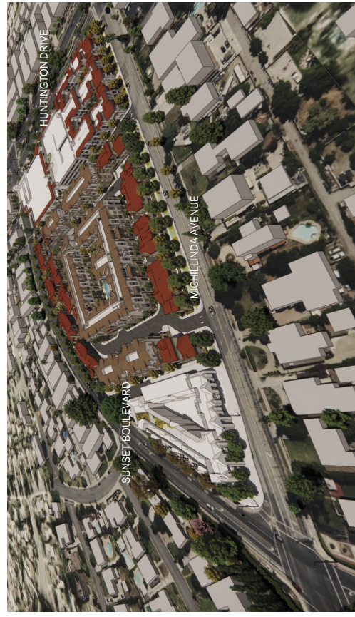
3. BIRD'S EYE VIEW FROM MICHILLINDA AVENUE

SOURCE: Humphreys & Partners Architects LP, 2023