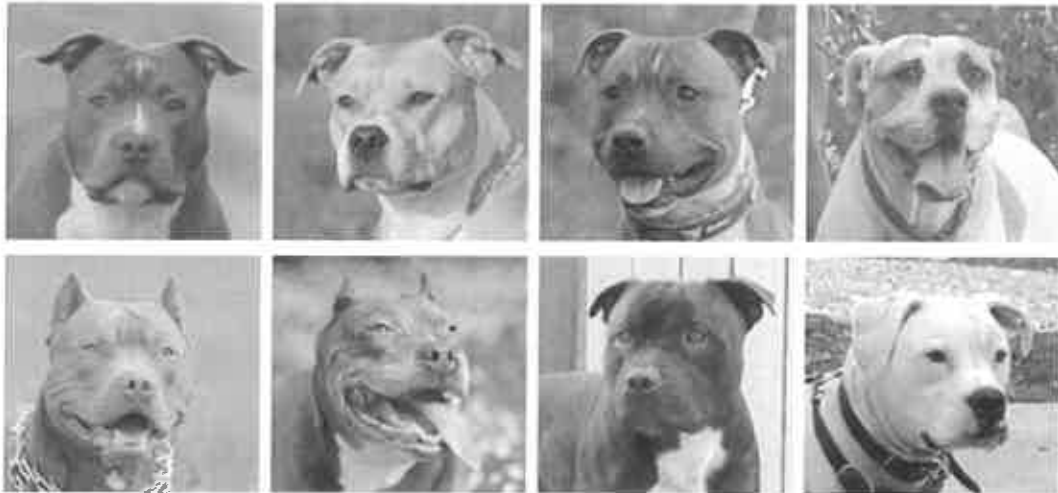
From left: American pit bull terrier, American Staffordshire terrier, Staffordshire bull terrier and American bulldog.

The legal definition of a pit bull is a class of dogs that includes several breeds: American pit bull terrier, American Staffordshire terrier, Staffordshire bull terrier and any other pure bred or mixed breed dog that is a combination of these dogs. Progressive legislation also includes the American bulldog, 1 a related breed that shares the same blood sport heritage of bull baiting. In 1999, the United Kennel Club became the only major kennel club that recognizes the American bulldog.